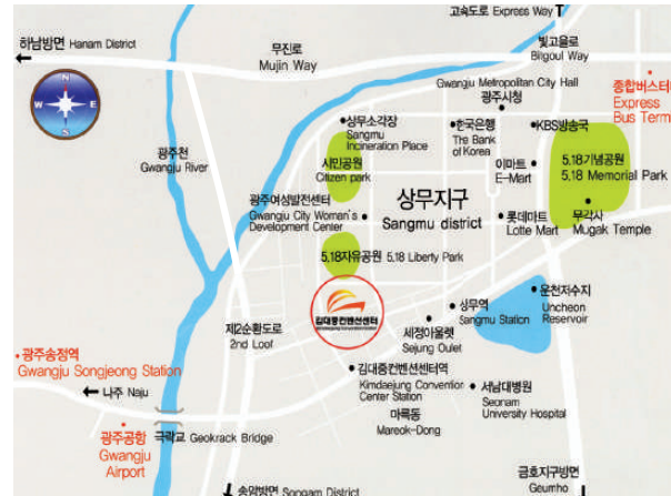
광주 서구 상무리로 30 김대중컨벤션센터